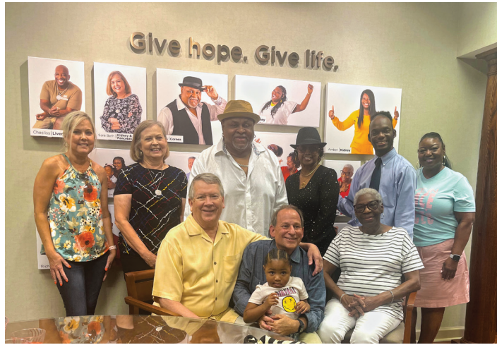
Click here to see ABC 24 coverage.

If you would like to view the wall, please stop by the MSTF office in Cordova Monday-Friday between 8 a.m. and 4 p.m.