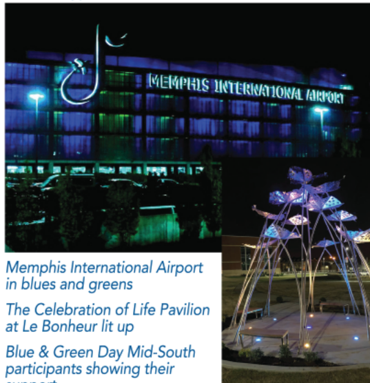
Memphis International Airport in blues and greens