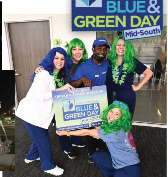
Blue & Green Day Mid-South participants showing their support

From participation numbers to social media activity, Blue & Green Day Mid-South 2023 raised the bar once again, surpassing the success of last year's record-setting outcome.