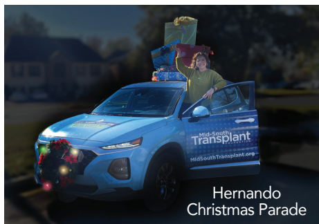
Hernando Christmas Parade