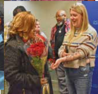
The 2025 Heart to Heart event is the largest known meeting of heart recipients and donor families.